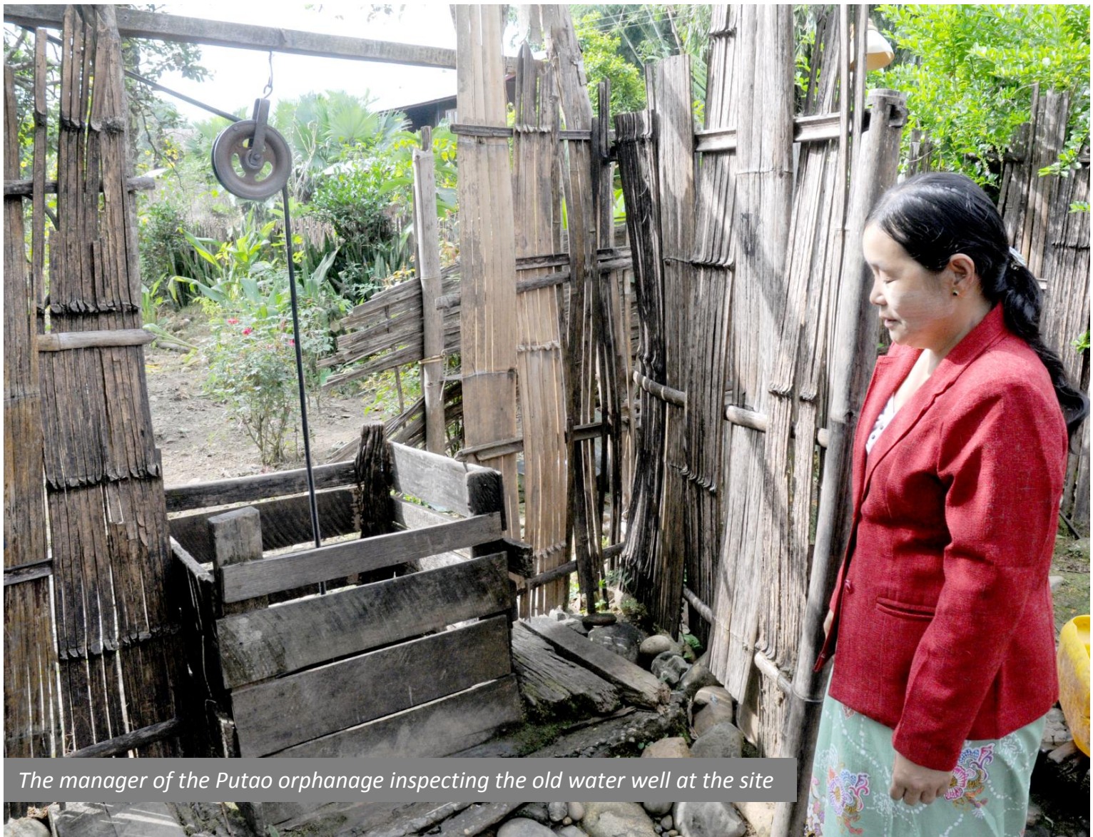
The manager of the Putao orphanage inspecting the old water well at the site

We launched a small support programme in 2015 at this orphanage, located in the far north of Myanmar. Home to just 20 boys and girls, and run by one very dedicated local lady, the orphanage has no regular donations or other means of support. When we asked the lady what her priorities were for the children, she told us she needed basic medicines and was particularly keen to improve the sanitation around the water well, which is the only source of water to the orphanage. We decided to help with both of these issues. We established a Medical Fund, with assistance from a local pharmacist, and we have rebuilt the water well, adding a wall and roof to reduce the risk of contamination of the supply. These are very basic and low-cost investments, but they have had an immediate impact on the conditions at the site.