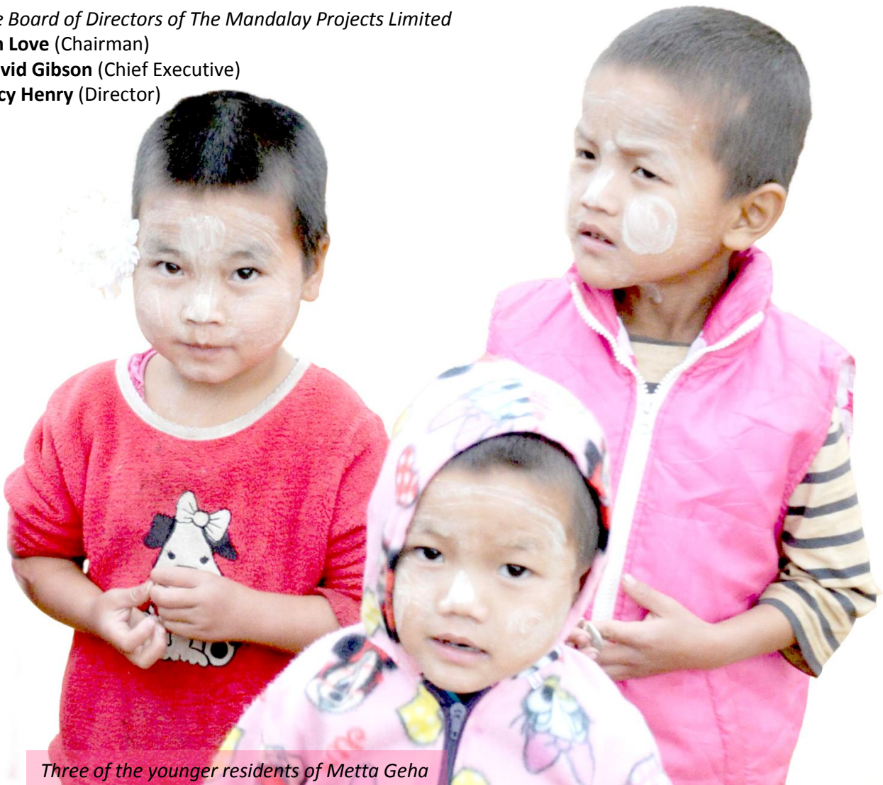
Three of the younger residents of Metta Geha