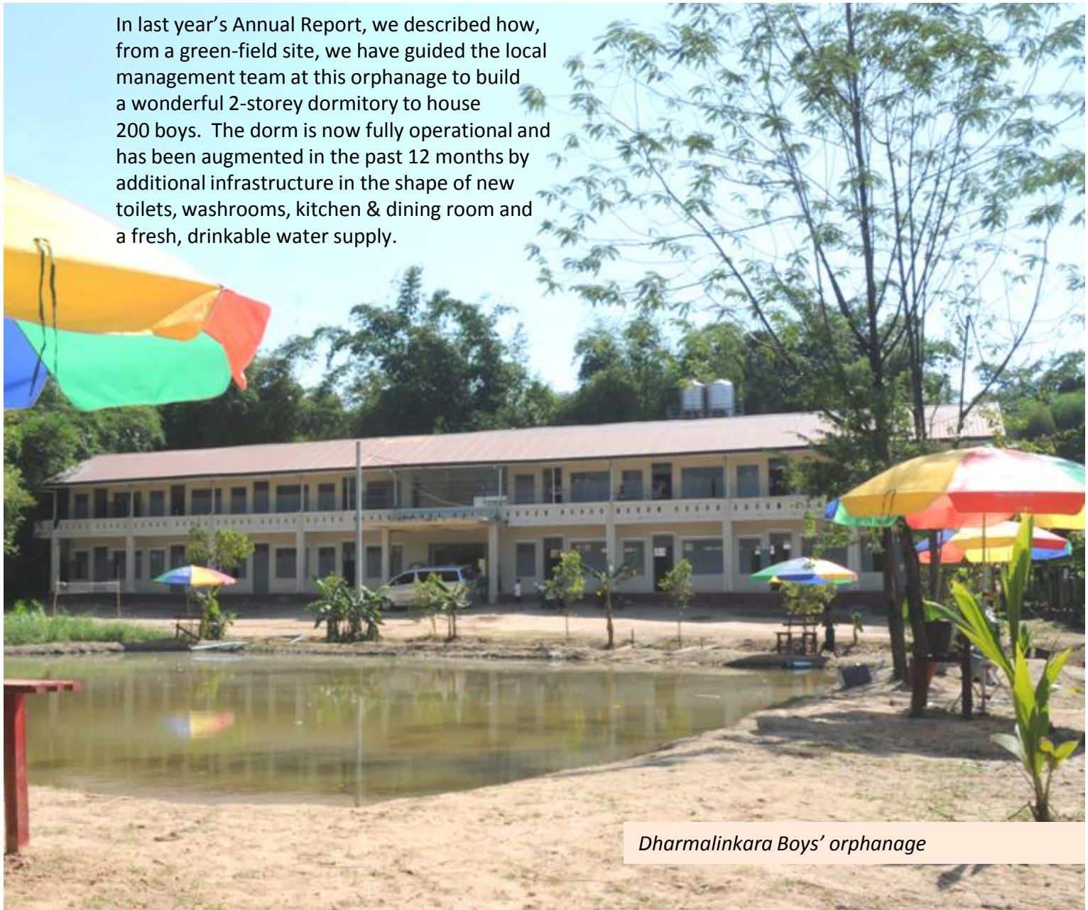
Dharmalinkara Boys' orphanage

In last year's Annual Report, we described how, from a green-field site, we have guided the local management team at this orphanage to build a wonderful 2-storey dormitory to house 200 boys. The dorm is now fully operational and has been augmented in the past 12 months by additional infrastructure in the shape of new toilets, washrooms, kitchen & dining room and a fresh, drinkable water supply.